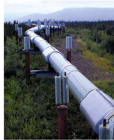
Fig. 2. An oil pipeline.

To this day, it remains uncertain whether the resources and technologies available in developing countries will be sufficient to satisfy a growing population's demands for food and other agricultural commodities [7]. Especially in the semi-arid tropics millions of people suffer from hunger because precipitation is scarce and unpredictable. In order to map out a farming strategy that uses the available resources most effectively, information on the temporal and spatial variability of environmental parameters, their impact on soil, crop, pests, diseases, and other components of farming is needed [8]–[10].